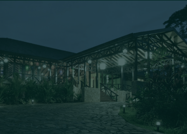
COMMUNITY SPACE | THE HEART