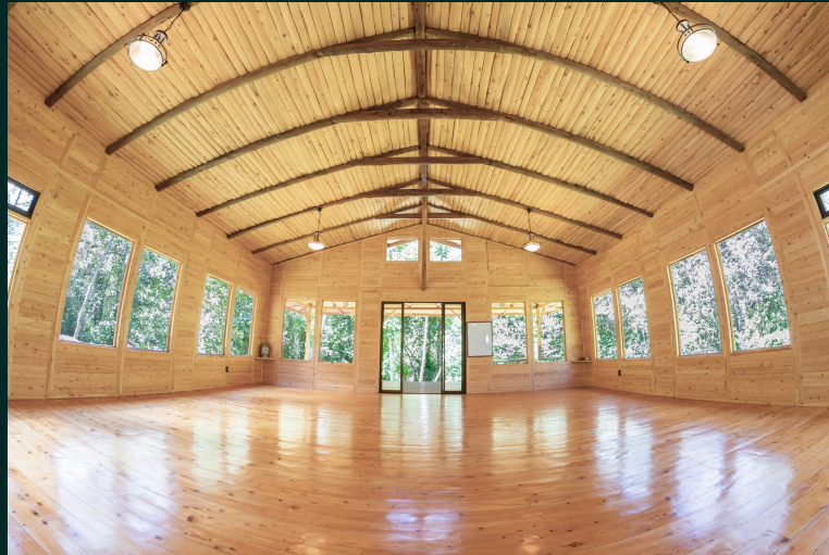
YOGA SHALA | THE TEMPLE