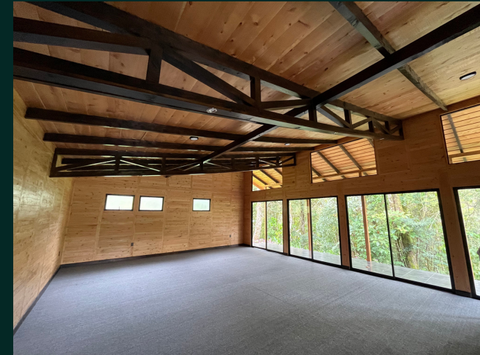
WORKSHOP | THE NEST